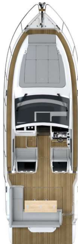
MAIN DECK Option with barbecue at stern, long platform and fixed cockpit table