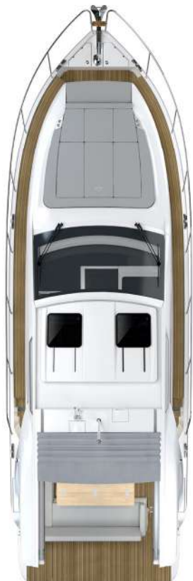
MAIN DECK Standard