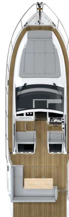
MAIN DECK Option with cockpit table to be transformed into sunpad and extended bathing platform