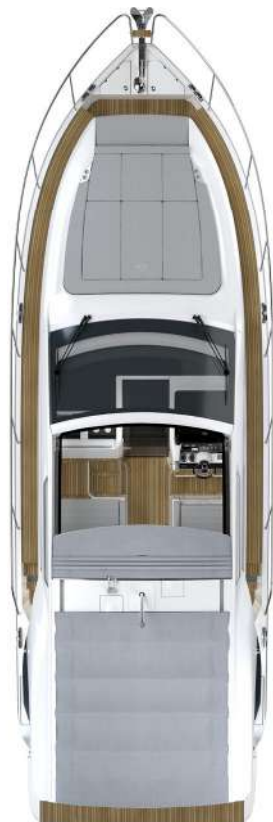
MAIN DECK Option with Soft-Top