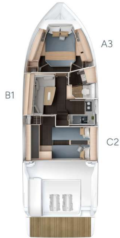
LOWER DECK Option galley with electric cooking top and microwave